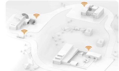
Tosca launches comprehensive supply chain IoT service, Asset IQ