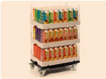
Enhancing point of purchase data for a global supplier