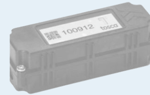
Trackers / Tags