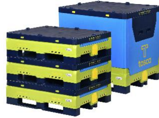
9 reasons to switch to reusable and foldable liquid IBCs