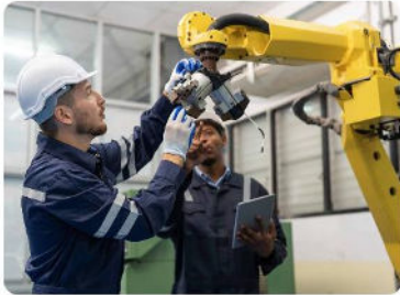
Supply chain outlook: What to expect near-future