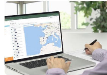
Five ways supply chain IoT can help your business: Use cases and examples