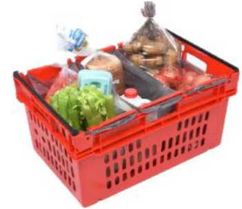
Preventing lost assets for a Pan-European retailer