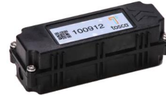
Arrival and departure updates for a large global retailer