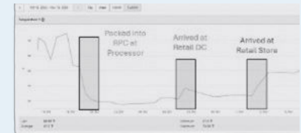
Dashboard / Analytics