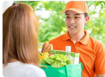
Grocery leader implements active IoT to reduce packaging losses